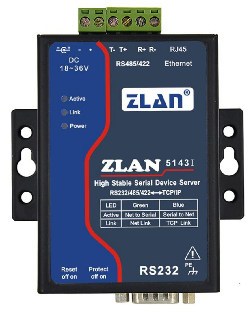
Figure 3 Front View

The front view of ZLAN5143I serial device server is shown in figure 3: ZLAN5143I use black SECC board against radiation. There are equipped with two "ear" in right and left, convenient to install. And can be equipped with guide installation accessories for convenient to be installed onto the guide rall.