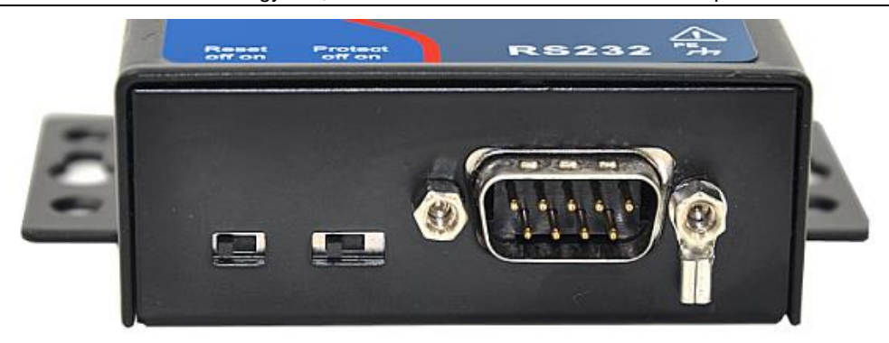
Figure 5 Port Diagram 2