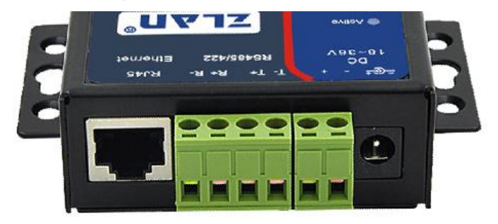
Figure 4 Port Diagram 1