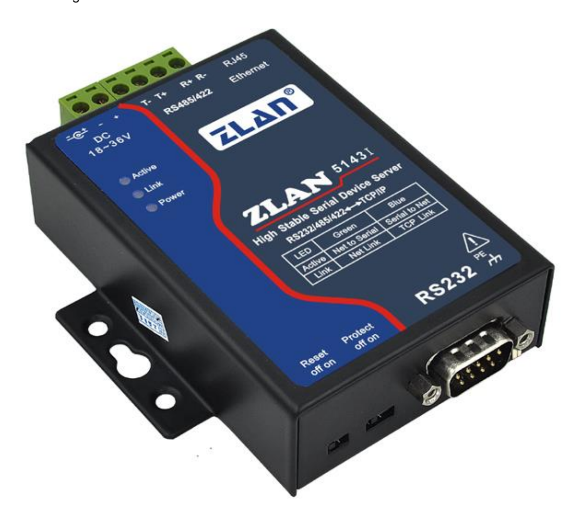
Figure 1 ZLAN5143I Isolating-type Serial Device Server

ZLAN5143I is a high reliability and high performance serial device server and Modbus Gateway product designed by Shanghai ZLAN special for lightning resistance, anti-electromagnetic interference and resisting bad environment requirements, is the flagship product on serial device server. Can be applied to industrial application requiring anti-jamming, anti-tunnel monitoring, wind power, field geological disasters monitoring and so on.